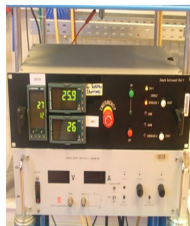
Temperature regulators and power control units.